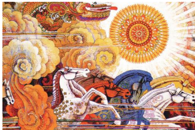
image of the festival. Many new year pictures, couplets and greetings are also based on these zodiac animals.

“In the Year of the Rat, you will have good luck; in the Year of the Ox, you will grow stronger; in the Year of the Tiger, you will behave more bravely; in the Year of the Rabbit, you will become smarter; in the Year of the Dragon, you will have a promising career; in the Year of the Snake, you will be safe and sound; in the Year of the Horse, you will live a brilliant life; in the Year of the Goat, you will enjoy prosperity; in the Year of the Monkey, you will get a promotion; in the Year of the Rooster, you will win a prize; in the Year of the Dog, you will flourish; in the Year of the Pig, you will become more prominent.” This is a Chinese