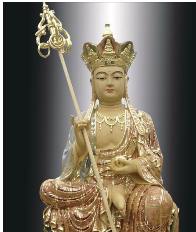
Portrait of Monk Xuanzang, a renowned Buddhist monk during the Tang Dynasty

with the monkey: The book's leading figure is none other than the Monkey King; the author Wu Cheng'en was born in 1500, which was the Year of the Monkey; and the renowned Buddhist monk Xuanzang of the Tang Dynasty, who was another leading character in the novel, was also born in the Year of the Monkey (AD 600).